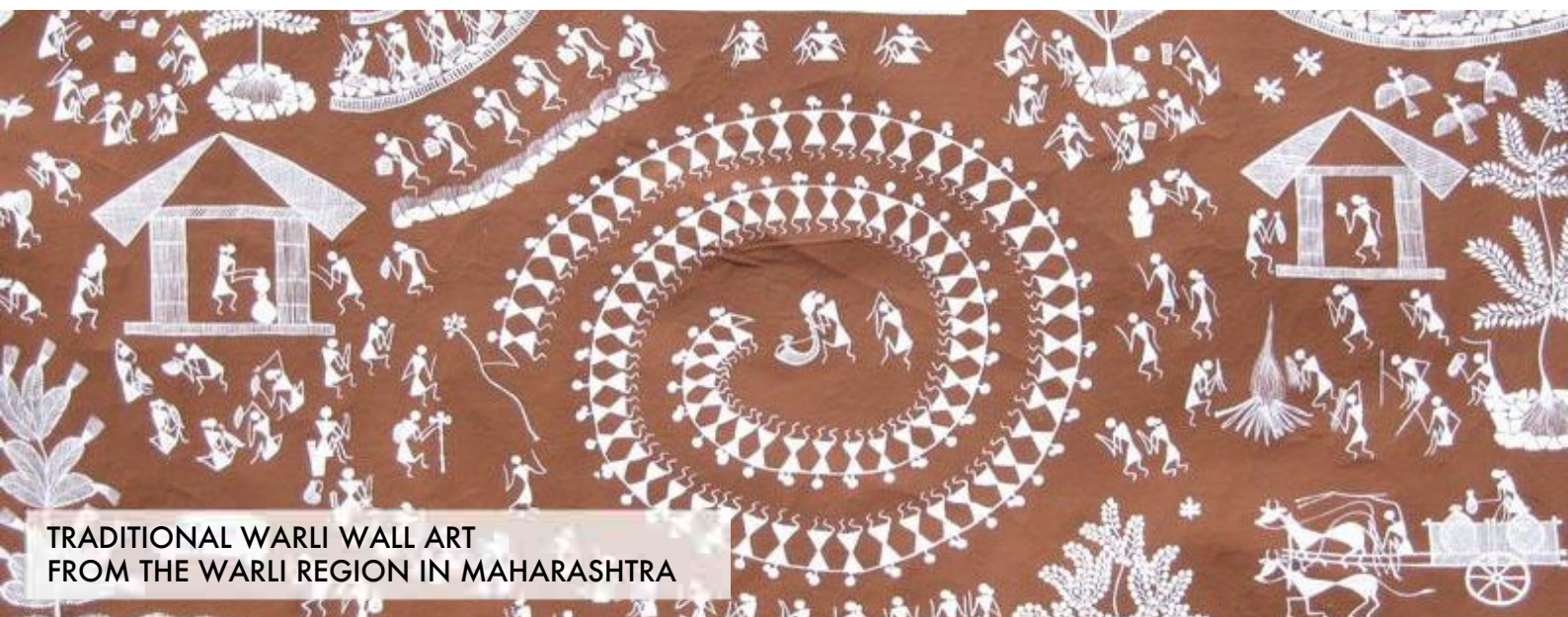
TRADITIONAL WARLI WALL ART FROM THE WARLI REGION IN MAHARASHTRA

Residential trends in India are many, given the diversity factor. Add to India's rich and varied cultural heritage, the new wave of progressive development in both urban and rural areas, and diversity deepens. In the past, each region had its own distinct characteristic elements. Although even today, places have their own design language, the 'genius loci' or the spirit of the place has undergone minor to massive changes. While some old features continue to exist, some others have reinvented themselves in the light of development, while still others have merged with influences from other quarters, with the world becoming a much smaller place. Given the current day scenario, it is indeed difficult to fit all the trends signifying India into a few pages. In realizing that, we chose a path, where we scanned the most prominent trends in a few sectors. These trends are more depictive of the Indian urban lifestyle and of course, are not free from influences of rural elements. What we have done in compiling these trends is to give a bird's eye view of interior design in the urban scenarios, some of which have a deep yet new cultural significance and others that are highly relevant to fast-paced global India.